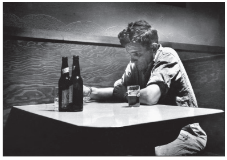
Man who just lost his job, MPW 6, Mexico 1954

These photographs have all (almost) been photographed with a digital