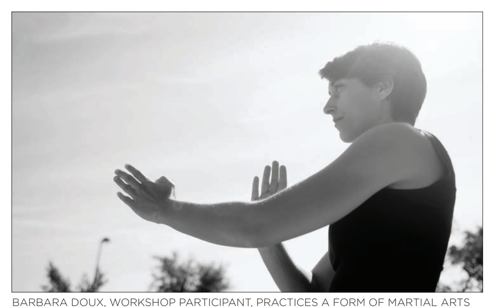
CALLED WING TSUN. SHE WILL OFFER A DEMONSTRATION AT THE SATURDAY PICNIC.